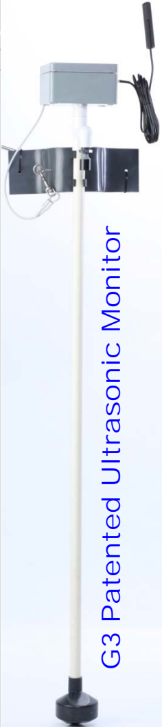
G3 Patented Ultrasonic Monitor

"G3" On-Line Temperature, Solids & Liquid Level Tank Monitoring System For Grease Traps & Septic Tanks